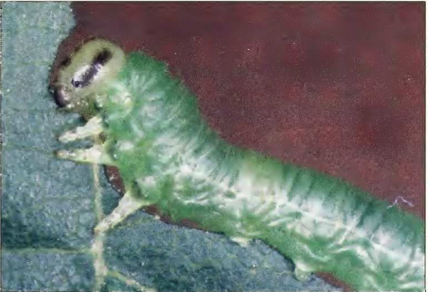
Fig. 2. An older larva of Pristiphora leucopus showing the head markings and reduced coxal markings of the final instar